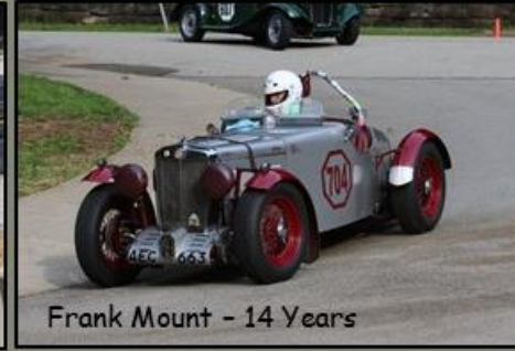
Frank Mount - 14 Years